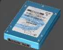
BLUE Series: 2.5" PCIe/SATA 8TB MLC NAND.