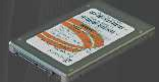
ORANGE Series: 2.5" PCIe/SATA 4 TB MLC NAND