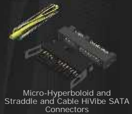
Micro-Hyperboloid and Straddle and Cable HiVibe SATA Connectors

HiVibe is available as an option on any Memkor 2.5" SATA SSD.