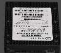
BLACK Series, 2.5" SATA 1024GB, Data Elimination