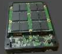
BLUE Series: 2.5" SATA 2TB SLC NAND Industrial