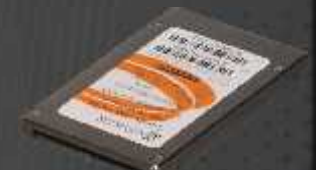
ORANGE Series: 2.5" PATA 1 TB MLC NAND