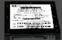
BLACK Series, 2.5" SATA 128GB, Data Elimination Extreme Ruggedization