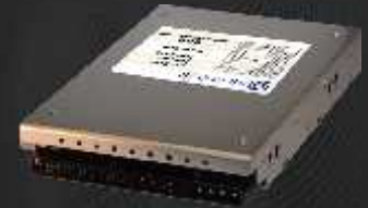
3.5" 50-pin, 8GB, SCSI SSD