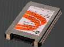
ORANGE Series: 1.8" μSATA 1TB MLC NAND